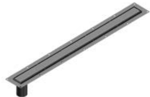
End Outlet with Liquid Membrane Flange

The information contained herein is not intended to replace the full product installation and safety information available or the experience of a trained product installer. You are required to thoroughly read all installation instructions and product safety information before beginning the installation of this product.